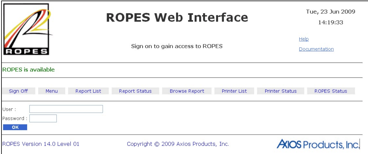
Figure 18 ROPES Web Interface Sign On Panel